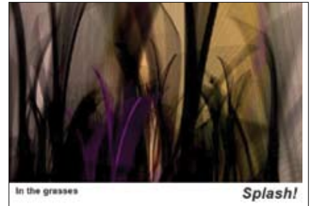
Two works created with Splash! by online users pictured above.